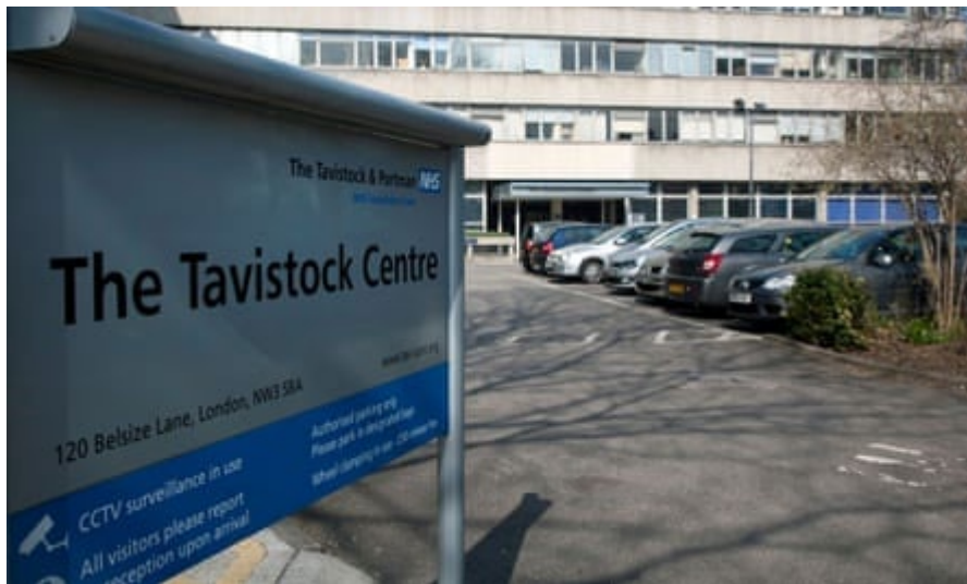
The Tavistock Centre in north London.